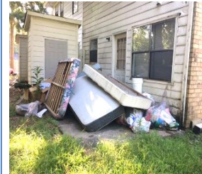
This is a violation! Clean it up and/or Report it

Board of Health Meetings 1 st Tuesday every month at 6:30 Borough Hall Residents welcome to attend