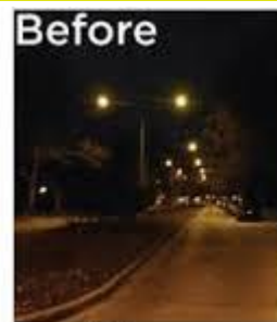
high pressure sodium lights